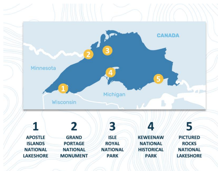
Figure 2. Locations of the National Parks of Lake Superior 2

The decarbonization does not have to be either 93% or 100% - it is on a continuum with these two levels illustrating two possibilities.